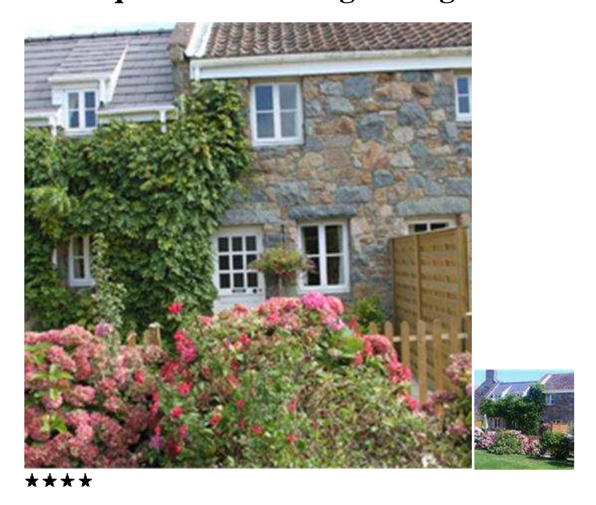
La Route des Piques St. Saviour's Guernsey GY7 9FW

5 stone cottages situated in the grounds of a 15th century listed farmhouse in the country parish of St Saviour, Guernsey. Comfortable and recently upgraded 1, 2 and 3 bedroom cottages with fully equipped kitchens and a range of appliances. Extensive gardens and tennis court on site. Short walk away from excellent restaurants. Tranquil location in rural lanes. Bus service operates to the property. Shops and restaurants within easy walking distance. Excellent West Coast beaches within 2 - 3 miles. Mid week bookings welcome subject to availability. Also available: 2 refurbished serviced suites with office facilities.