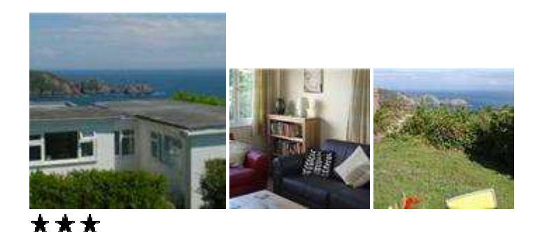
Icart, St Martin's, Guernsey, GY4 6JG

The views from the cliff path outside the bungalow are some of the finest in Guernsey. Comfortable and well equipped for four, it's ideal for walkers, beach-lovers or just relaxing-in-the-garden types. We supply linen and a welcome pack, groceries can be ordered in advance. All you have to do is arrive ready for a great holiday.