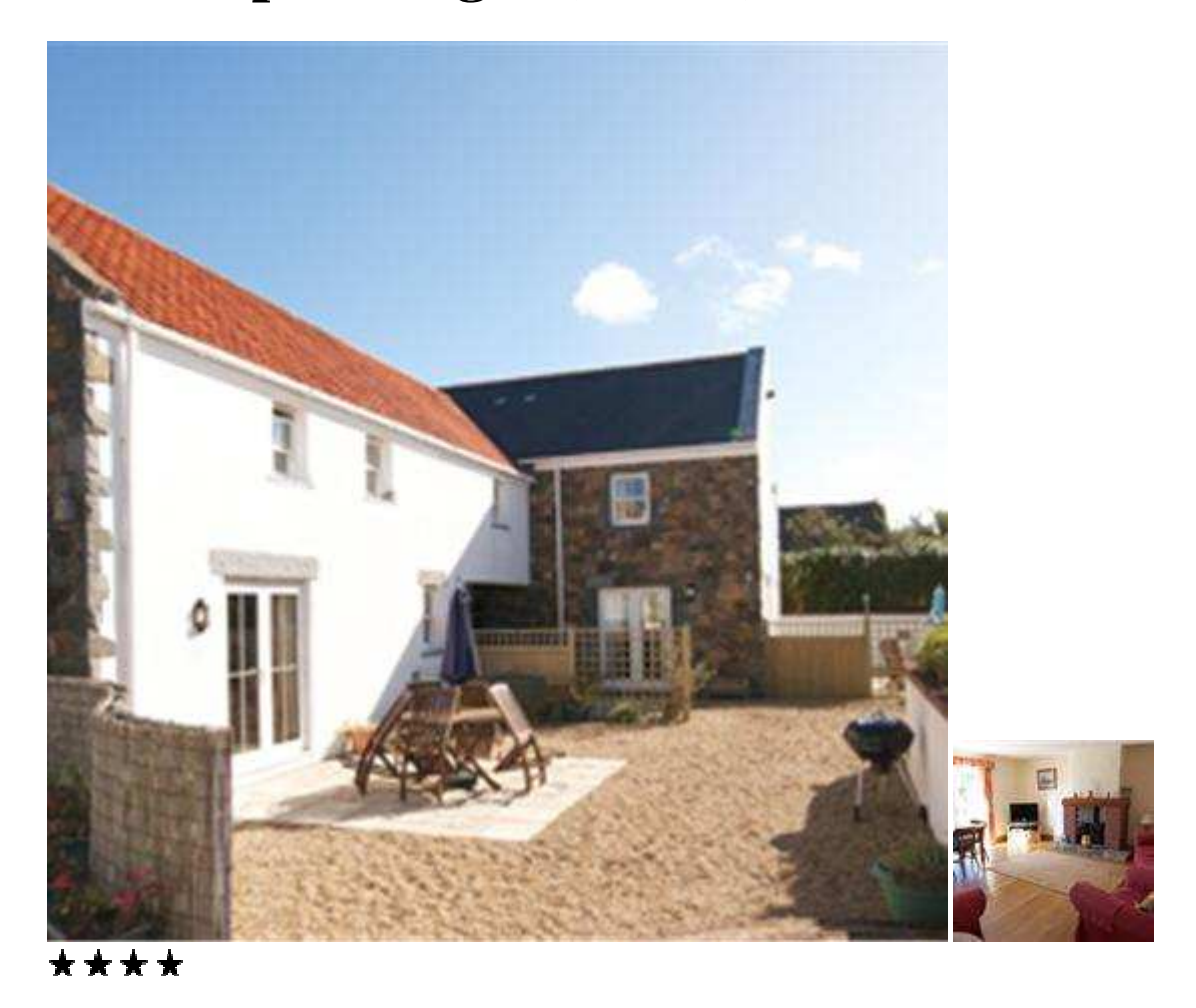
Le Petit Manoir, Pleinmont Road, Torteval, Guernsey, GY8 0LP

called Le Petit Manoir(pictured left), La Petite Grange and La Grange. The first two cottages sleep two adults and a child under 11 and La Grange sleeps four adults. All three have a fully equipped kitchen/diner with electric oven, microwave oven, fridge, freezer and a dishwasher in La Grange. The bathrooms all have baths with overhead showers. La Petite Grange and La Grange each have a conservatory and all three have colour televisions and video recorders. There is a separate laundry room with washing machines and tumble dryer and a payphone. Each cottage has its own patio area and parking and all bed linen, towels, cots and high chairs are included in the price. Open all year. La Grange and La Petite Grange Wed-Wed bookings and Le Petit Manoir Sat-Sat bookings. Payment also accepted by BACS. Please contact Shaaron Sauvarin.