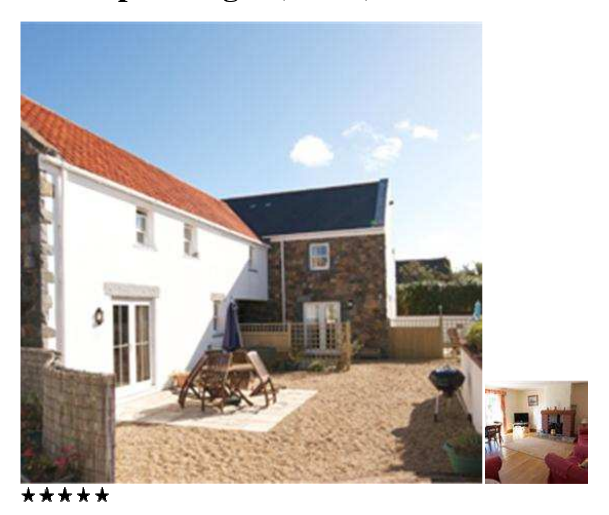
Le Petit Manoir, Pleinmont Road, Torteval, Guernsey, GY8 0LP

two large, light and spacious units with each one having a double bedroom ensuite and a treble bedroom ensuite. There is a large open plan living area with fully fitted kitchen including electric oven and hob, microwave, fridge/freezer, dishwasher. A downstairs cloakroom with toilet and wash hand basin. The lounges have a colour television with video recorder and one of the units has a fireplace with wood burning stove. Both are centrally heated and double glazed with their own patio areas and parking. There is a separate laundry room adjacent to Le Faucon with washing machines and tumble dryer for the sole use of visitors to La Chouette and Le Faucon. All bed linen, towels, cots and high chairs are included in the price. Open all year. Saturday-Saturday bookings. Payment also accepted by BACS.