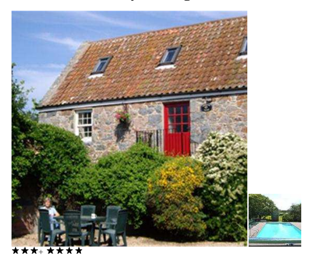
La Gallie, Rue de la Gallie, St Peters, GY7 9ED

Situated in the quiet country lanes of St Pierre du Bois, Honeysuckle and Primrose Cottage lie across a courtyard from our own 200 year old traditional granite farmhouse. They are set in an acre of child friendly garden surrounded by fields. The local supermarket, post office and pub are within easy walking distance and the beautiful cliff paths and unspoilt south coast beaches are close at hand. The property itself boasts an all weather tennis court and a superb outdoor swimming pool heated from May to September, in addition to a play area and ample space for ball games. A cot is available for small children in both cottages. We are sorry but we do not take pets and we operate a no smoking policy in the cottages. For further information please visit our website.