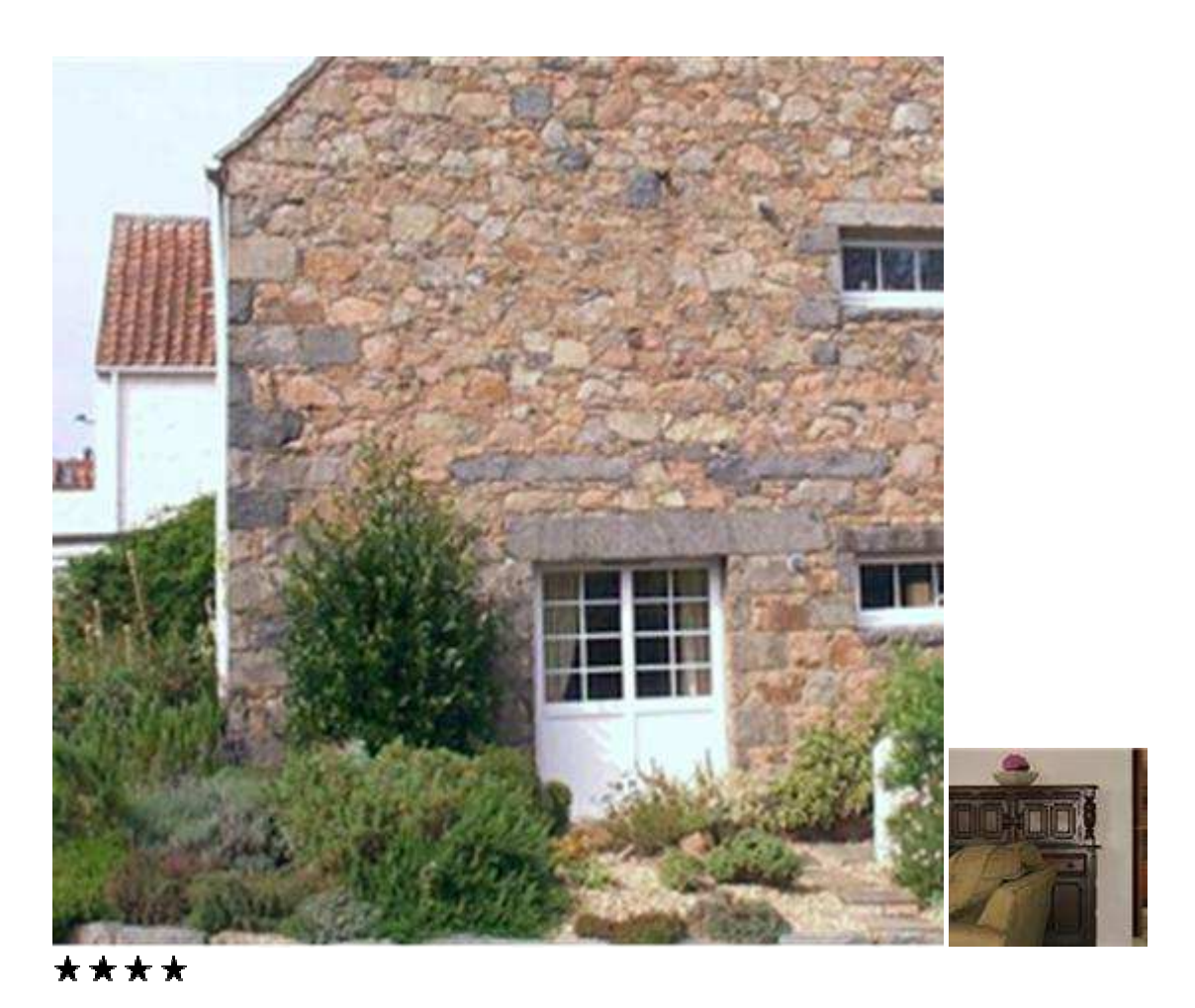
King's Mills, Castel, Guernsey, GY5 7JT

Located in the heart of rural Guernsey, our cottages give you the freedom to explore at your leisure. From our doorstep are breathtaking walks through picturesque and tranquil country lanes, yet the sand and surf of Vazon Bay are just fifteen minutes' stroll away. In close proximity there is a country farm hotel with lounge bar and recommended restaurant.